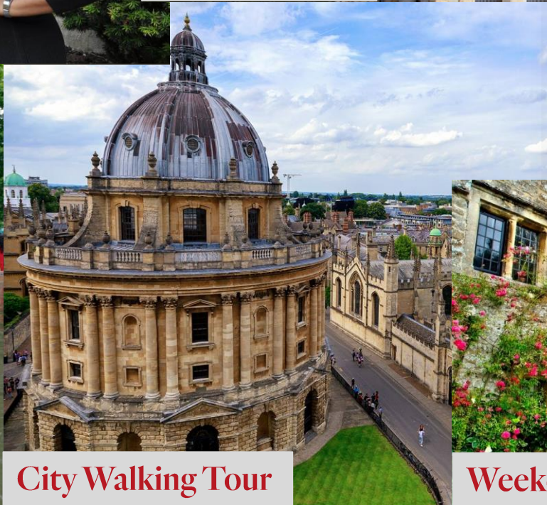
City Walking Tour